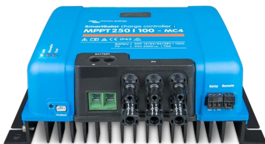
SmartSolar Charge Controller MPPT 250/100-MCA without display