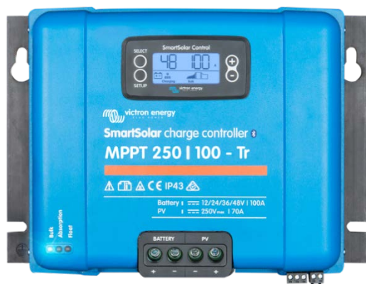
SmartSolar Charge Controller MPPT 250/100-Tr with pluggable display