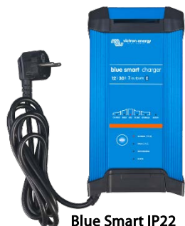
Blue Smart IP22 12/30 (3)